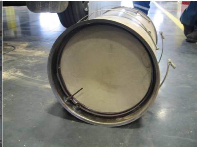
Same DPF after 3 months on Enerburn, no Active Re-gens